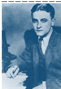
F. Scott Fitzgerald (1896–1940)